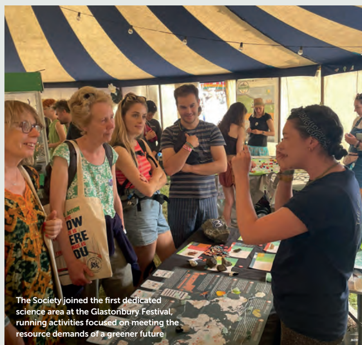
The Society joined the first dedicated science area at the Glastonbury Festival, running activities focused on meeting the resource demands of a greener future